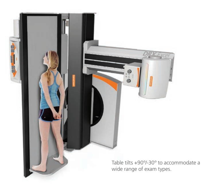
Image-stitching station combines multiple images into one for easier reading of spine and lower-limb exams.

Four-way table movement facilitates easier patient positioning.