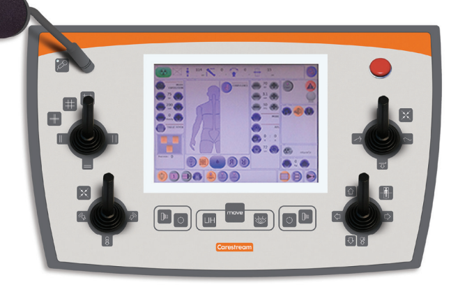
This easy-to-use console features a large color touch-screen and intuitive controls. It integrates all table movements, generator settings and APR functions into a single, efficient interface. Auto-positioning facilitates faster exam set-up times.

The DRX-Excel can transcend these limitations – providing an outstanding experience for both technologists and patients.