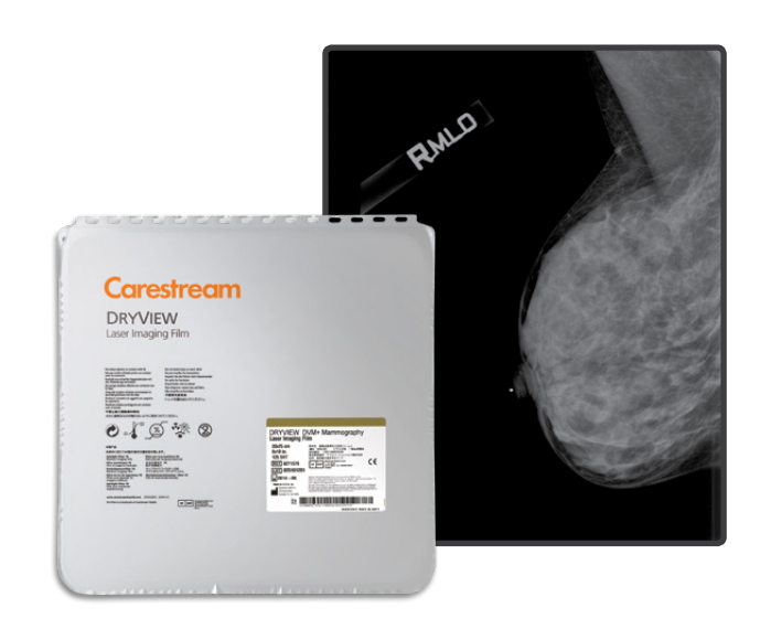
DRYVIEW film delivers high film densities preferred for mammography applications.

For mid-to high-volume environments, the high-speed DRYVIEW 6950 Laser Imager can keep your operation running smoothly and efficiently even during your busiest periods. The system delivers from 160 to 250 films per hour with extremely sharp 650 ppi resolution on every film size. With this performance you can rest assured that as advancements in modalities occur, you'll be equipped for the future.