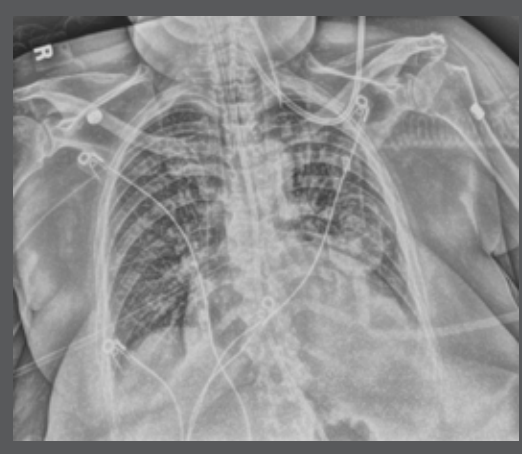
With Tube and Line Visualization