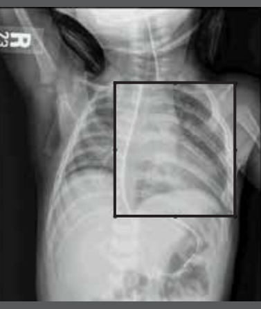
With Pediatric Optio