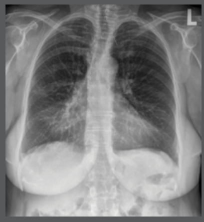
Without Bone Suppression

Based on a powerful form of artificial intelligence called Random Forests, this feature creates a companion image that suppresses the appearance of bone and enhances the visualization of soft tissue, to increase clinical confidence in pathology assessments. Another benefit – this option requires no additional exposure to the patient.