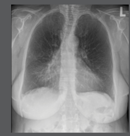
With Bone Suppress