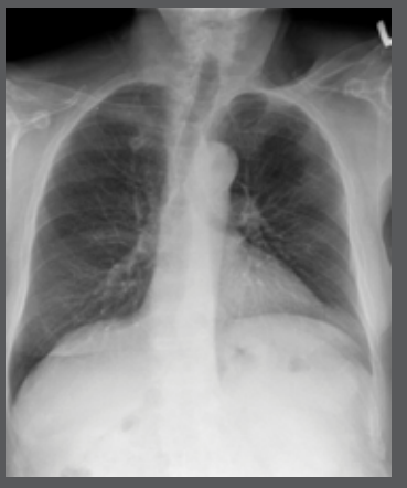
Standard Chest X-ray

This option uses patented differential filtration to subtract rapidly acquired low- and high-energy acquisitions for the generation of bone and soft-tissue images. Using this feature allows for more sensitive detection of abnormalities in the lung and improved assessment of bone abnormalities.