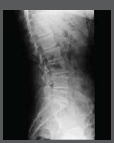
Most Popular: Medium latitude, increased detail and nominal sharpness