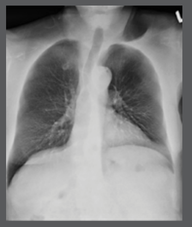
Dual Energy – Soft Tissue