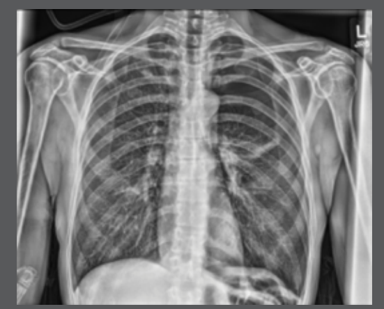
With Pneumothorax Visualization