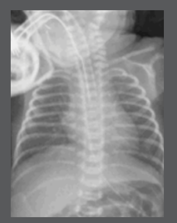
Neonate (very low birth weight 55 kVp, 1.0 mAs, 0.024 DAP, 126 IEC EI