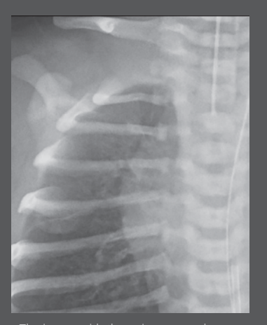
The image with the noise removed, for better clarity and easier reading