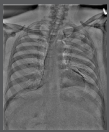
Dual Energy – Bone