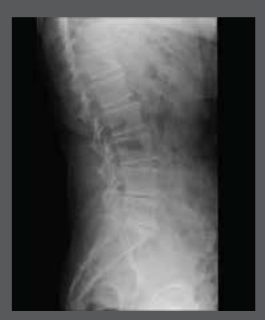
Fixed Processing: The baseline look – like analog screen film, with fixed contrast, detail and sharoness

Supercharge processing productivity with Enhanced Visualization Processing (EVP) Plus. EVP Plus image processing supports multiband-frequency processing to provide better noise control, sharpness, contrast and density while minimizing artifacts.