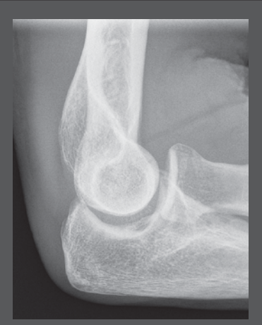
Elbow after SNC is applied, preserving the trabeculae in the bone and making them more prominent

*Verified using Carestream detectors in a reader study performed by board-certified radiologists comparing pairwise images taken at nominal dose CsI ISO 400 speed / GOS ISO 320 speed) and reduced dose (CsI ISO 800 speed / GOS ISO 500 speed) with SNC.