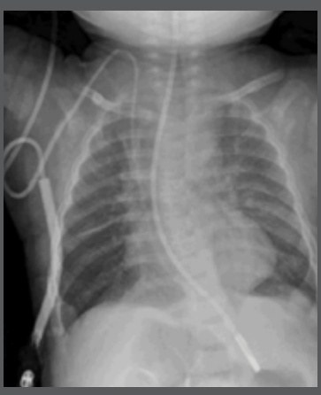
Infant 65 kVp, 0.9 mAs, 0.108 DAP, 209 IEC EI