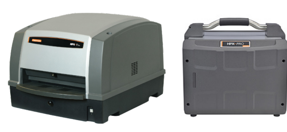
INDUSTREX Computed Radiography (CR)