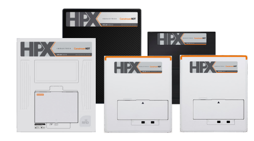
INDUSTREX Digital Radiography (DR)

1. ASTM (2021), ASTM E1316 – 21a, Standard Terminology for Nondestructive Examinations, West Conshohocken, PA, ASTM International, 2020.