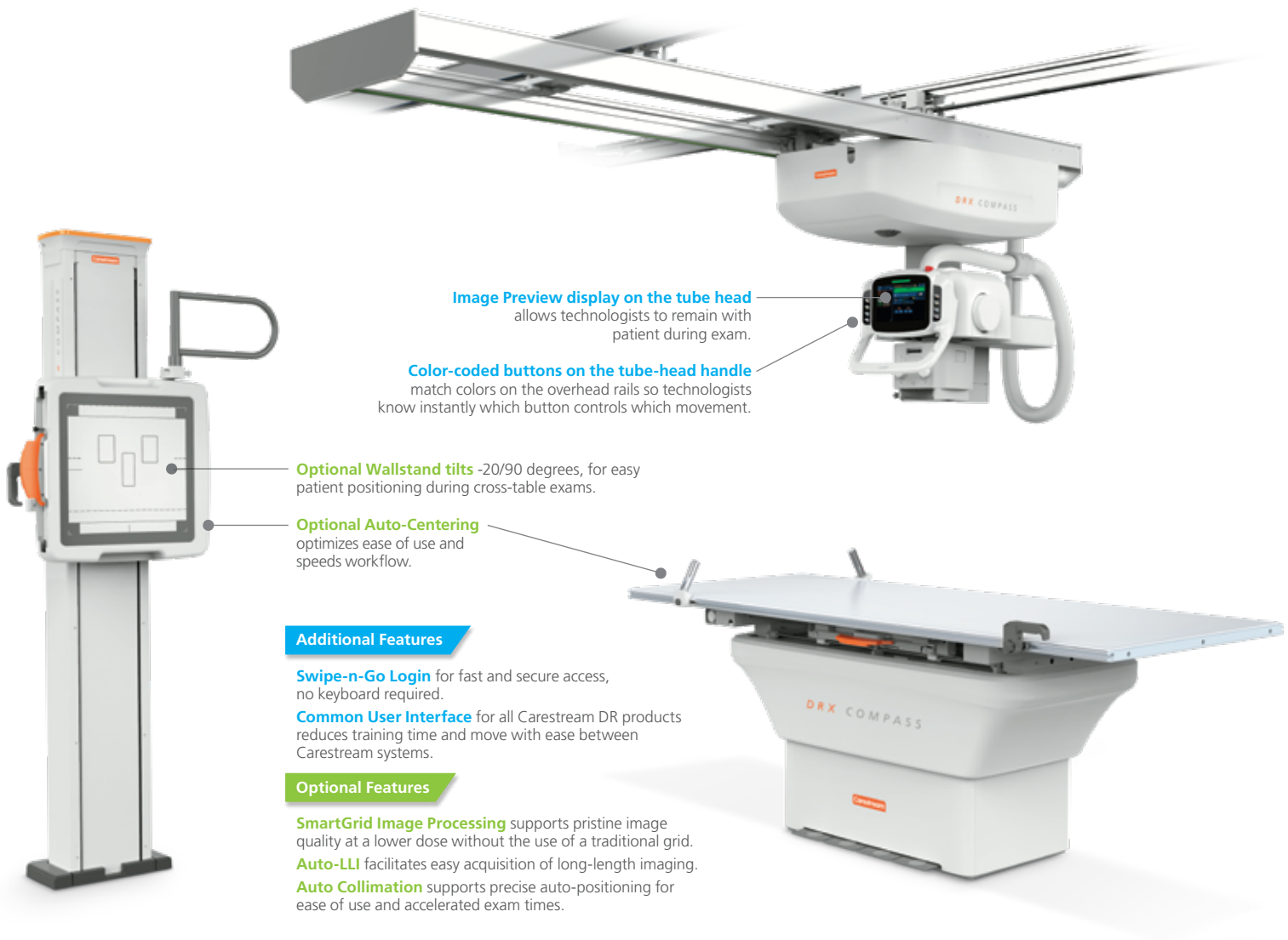
Image Preview display on the tube head allows technologists to remain with patient during exam.

Experience versatility, functionality and superb image quality.