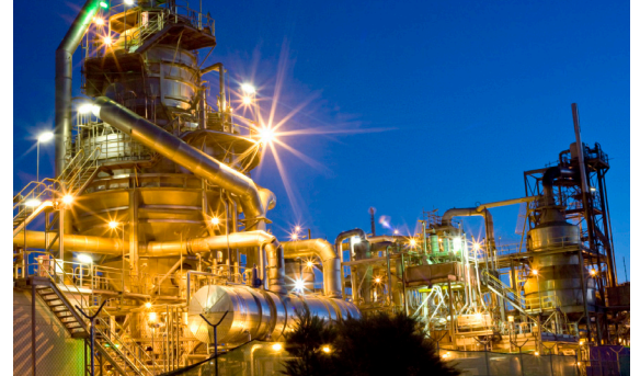
Oil and Gas