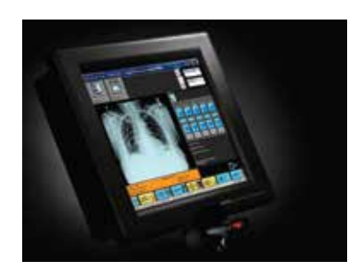
Remote Operations Panel