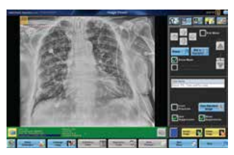
Tube and Line Visualization