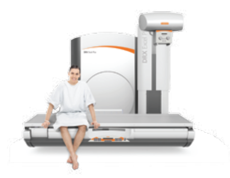
CARESTREAM DRX-Excel Plus This is an innovative combination of fluoroscopy and general radiology in one compact system. It delivers accelerated workflow and high-resolution images.