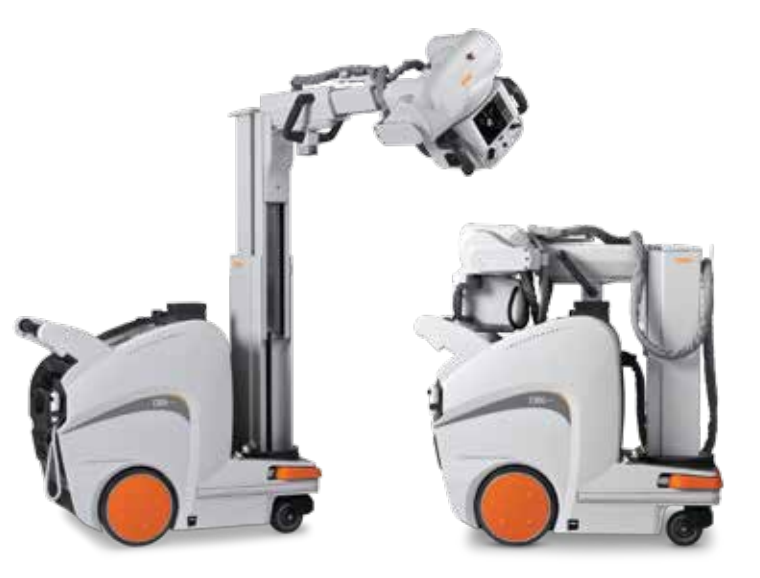
The DRX-Revolution's collapsible column makes it easy to navigate.

For accelerated productivity and elevated patient care, join the revolution. The DRX-Revolution.