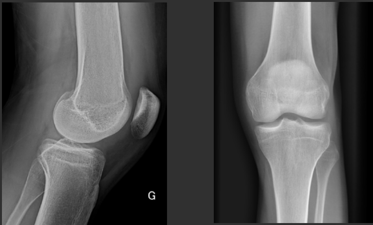
Figure 1 Standard 2D X-ray of knee trauma patient. Evidence of intra-articular fluid, but with no obvious fracture seen.

The traditional 2D projection X-rays (see Figure 1) show no clear evidence of fracture but did show intra-articular fluid. Patient was unable to walk, which is not typically consistent with ligament/soft tissue damage and a tibial plateau fracture was suspected. Normal protocol would be for the patient to be given an MRI at 2-3 weeks post injury.