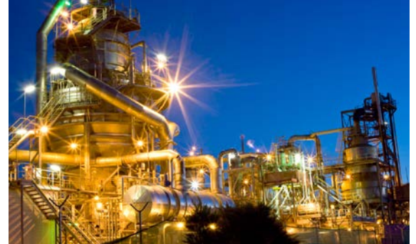
Oil and Gas