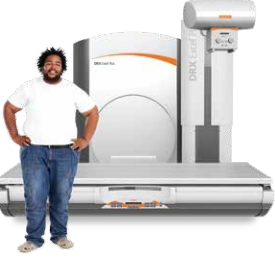
A 265 kg weight capacity means this table accommodates heavier patients.