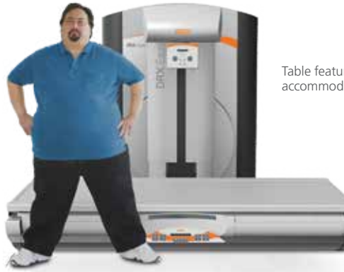
Table features a 265kg weight capacity to accommodate heavier patients.