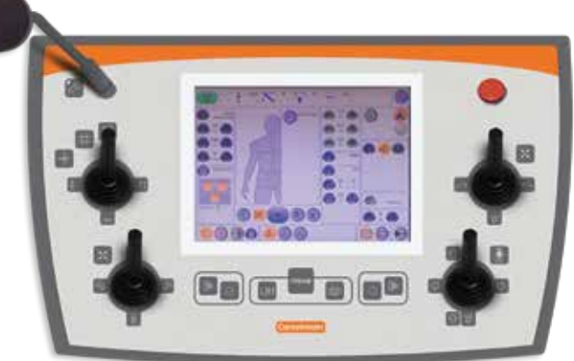
This easy-to-use console features a large color touchscreen and intuitive controls. It integrates all table movements, generator settings and APR functions into a single, efficient interface. Auto-positioning facilitates faster exam set-up times.

The DRX-Excel Plus can transcend these limitations – providing an outstanding experience for both technologists and patients.