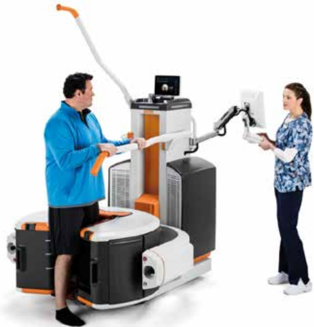
Figure 3: CARESTREAM OnSight 3D Extremity System

As illustrated, these high-quality images provide multiplanar two- and three-dimensional visualization for practitioners who think and work in three dimensions. These images make it easier for orthopedic physicians to educate their patients, teach and train medical students, residents, and post-graduate fellows. A significant limitation of current CT technology is that current technique forces image acquisition with the subject in a supine, relaxed position. Some have tried to simulate weight bearing in a CT scanner by custom designing a rig to apply longitudinal load through the patient for imaging of the spine or lower extremity. These methods are at worst, a poor depiction of functional anatomy, and at best cumbersome and a less-than-accurate simulation of function. A new cone beam CT scanner, the OnSight 3D Extremity System, is in development by Carestream Health (Rochester NY) to acquire weight-bearing images of the extremities. The prototype is designed to offer high-quality, portable, low-dose 3D point-of-care imaging by orthopaedic and sports medicine practices, hospitals, imaging centers, urgent care facilities and other healthcare providers.