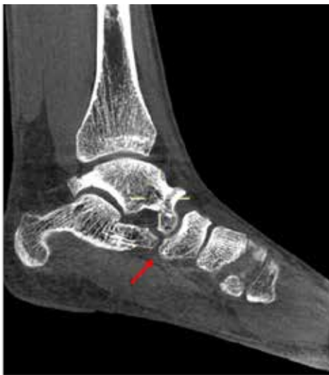
Fig. 2: High-resolution 3D CBCT of the ankle demonstrates no osseous coalition at the Calcaneo-navicular interface.