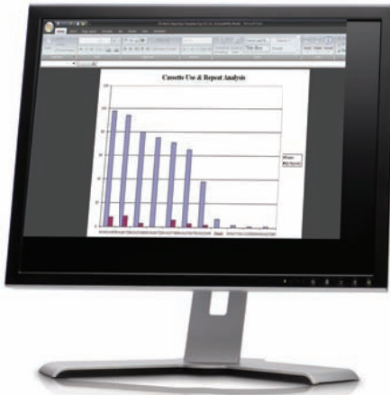
Cassette Use and Repeat Analysis Chart