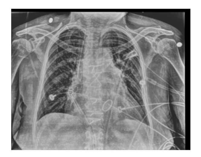
Figure 1 – Left: a portable chest X-ray image processed using default automatic processing. Right: the same image processed using the Tube & Line Visualization Software. The two images are delivered together to PACS.

For some abnormalities, the visual characteristics of the key diagnostic features may be masked by, or confounded with, normal anatomical structures. This is a very different effect from the insufficient grayscale resolution issue described above. This effect can be more readily thought of as visual interference between the features corresponding to the abnormality and the normal anatomical structures.