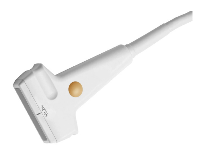
Figure 1: 10L2w Transducer