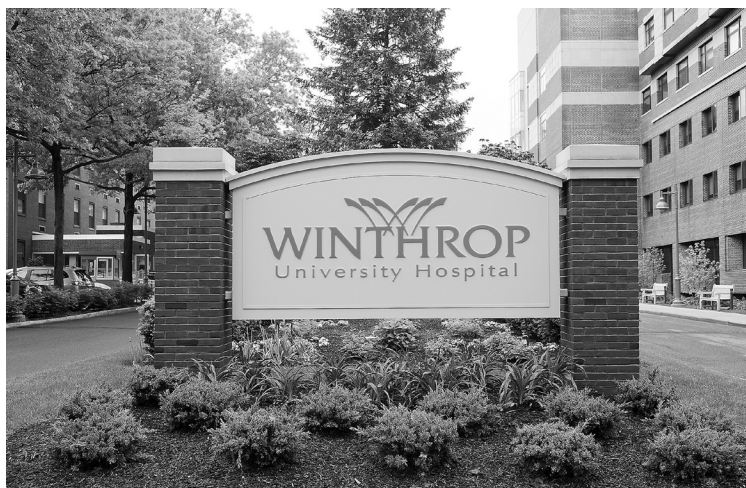
Winthrop-University Hospital purchased a Carestream cloud-based solution for PACS and vendor-neutral storage along with an on-site RIS that is offered on a pay-per-use basis.