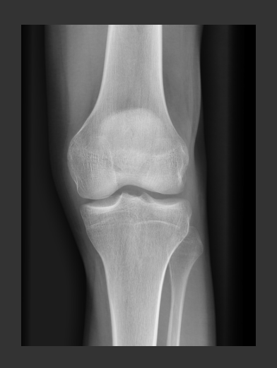
Figure 1 Standard 2D X-ray of knee trauma patient. Evidence of intra- articular fluid, but with no obvious fracture seen.