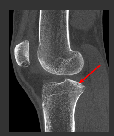
Figure 2 Axial and sagittal slices from the patient acquired with the OnSight extremity CT system identifying a clear impaction fracture of the lateral aspect of the posterior tibial plateau not seen in Figure 1.

It is important that this type of fracture is identified and addressed since it can lead to osteoarthritis if left untreated. It also helps to determine the length of time the patient should be in a cast. This example highlights the value of the inherently high image quality and 3D nature of the data provided by the OnSight extremity CT system.