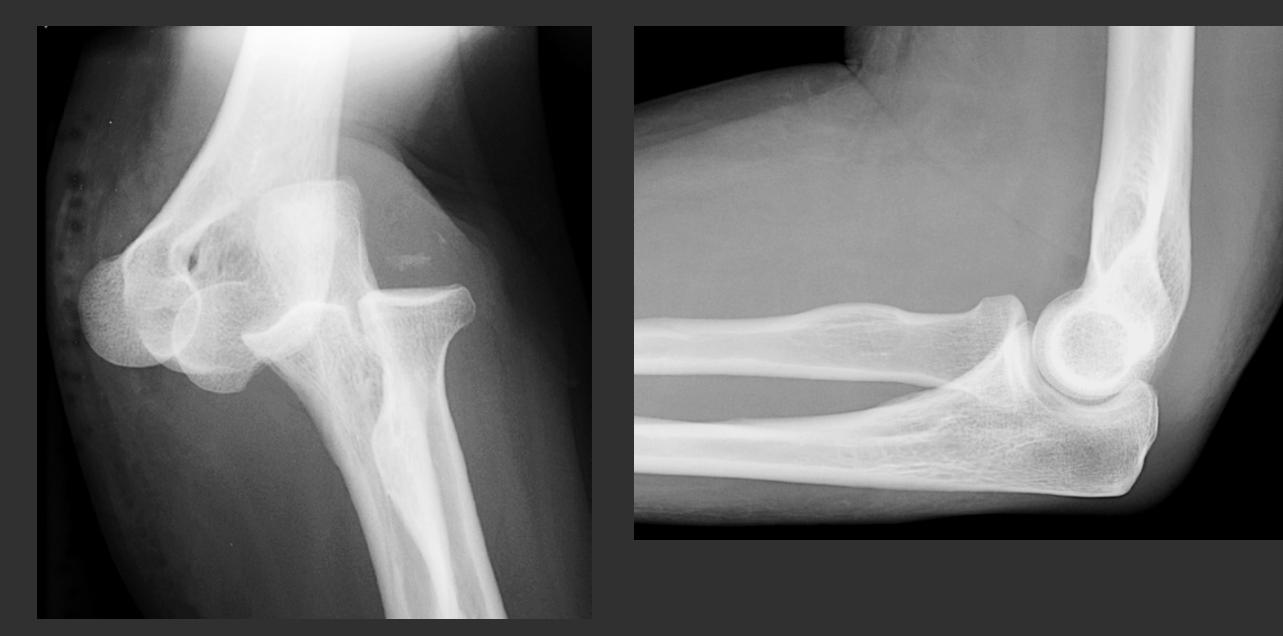
Figure 1 Standard 2D X-ray of elbow trauma patient with obvious dislocation pre- and postreduction.

The traditional X-ray shows obvious dislocation of the elbow. (See Figure 1 for pre- and post-reduction X-rays.)