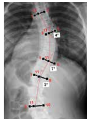
Measurement from Horizontal