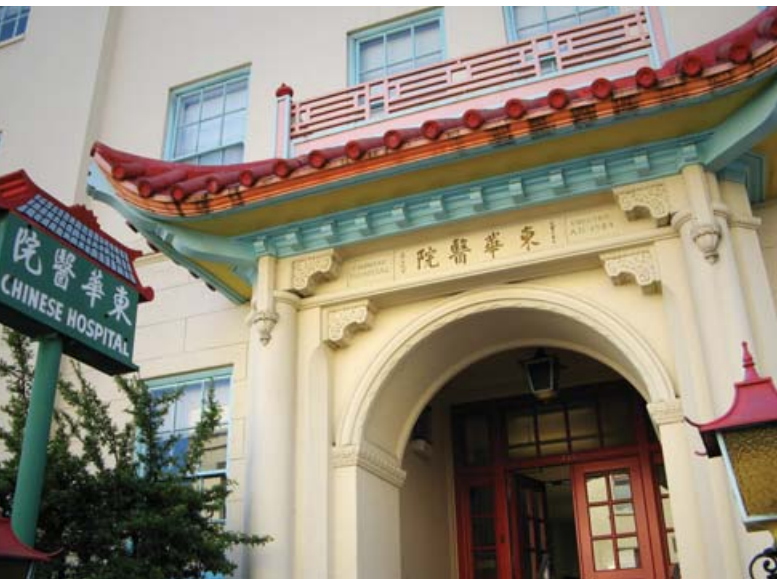
Chinese Hospital is located in the heart of San Francisco's Chinatown.