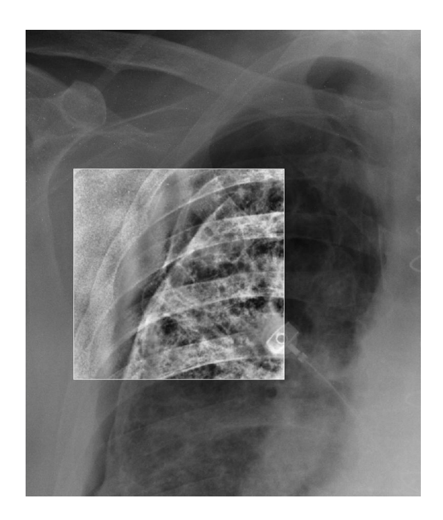
Figure 2 – Left: a portable chest X-ray image illustrating a large pneumothorax. Right: an insert showing the texture differences resulting from processing the image using the pneumothorax-enhancement filter.

The images shown in Figure 3 compare a portable chest X-ray image presented using the default processing (on the left) against the same image processed with the pneumothorax-enhancement filter (on the right).