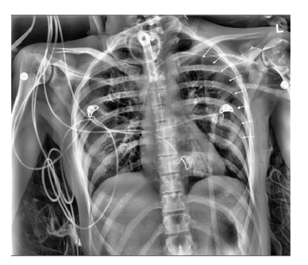
Figure 3 – Left: a portable chest X-ray image of a patient with a pneumothorax. Right: the companion view processed using the pneumothorax texture-enhancement filter. The lung edge is indicated by arrows.