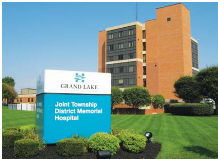
Joint Township District Memorial Hospital is located in St. Marys, Ohio.

“We did not want to be locked into supporting disparate storage silos as we add new applications. Carestream Health’s EIM architecture can support efficient centralized management of all kinds of data and imaging applications.”