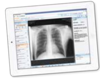
Clinical Collaboration Platform Our uniquely designed software platform provides fast, easy access to patient images and data – for collaboration across the entire healthcare enterprise.