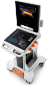
CARESTREAM Touch Prime Ultrasound With a configurable All-Touch control panel, this system offers intuitive operation, innovative productivity tools and advanced image quality.