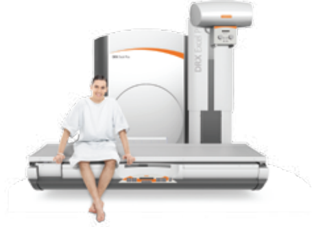
CARESTREAM DRX-Excel Plus This is an innovative combination of fluoroscopy and general radiology in one compact system. It delivers accelerated workflow and high-resolution images.