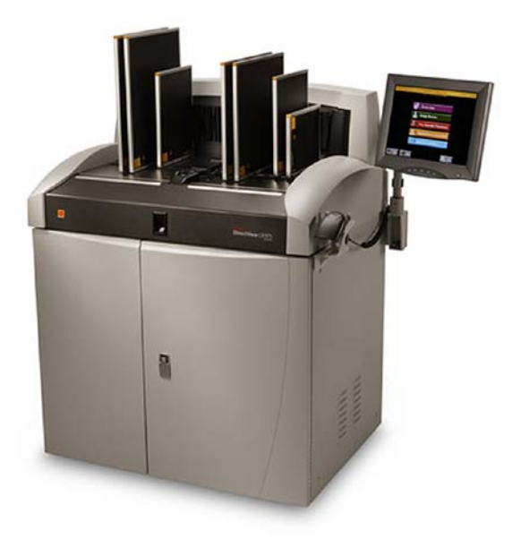
Fig 1. Equipment being used and interrogated by the digital dashboard software.

ogists or cassettes, to name a few examples that can be derived from the accumulated data. It is expected this data will prove to be invaluable in helping radiology imaging managers improve workflow, patient care, and enhance departmental productivity.